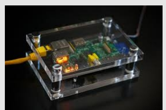
Figure 1.4: a boxed Raspberry Pi

Have you heard of the Raspberry Pi? It's a tiny single-board computer ( SBC ) about the size of a credit card, and about the price of a couple of pizzas. It's not a wimpy little thing, either: the P1 2 has a quad-core CPU, USB and HDMI video. A tiny microSD card serves as the hard drive, and swaps so easily you can use several operating systems.